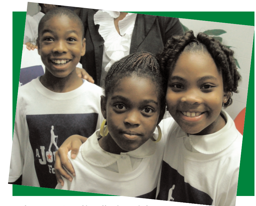
Students from D.C.'s Friendship Public Charter School - Chamberlain Campus

Laws must be clear - charter schools are PUBLIC schools. Their students should be funded like all other public school students with identical funding amounts and funding streams. Charters thrive in states that fund them equitably; they are challenged when they are not.